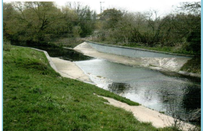
River Flow Gauging Station

So why build a fish pass or alter the structure to accommodate fish ? incidentally another requirement was that the structure should continue to measure river flow.