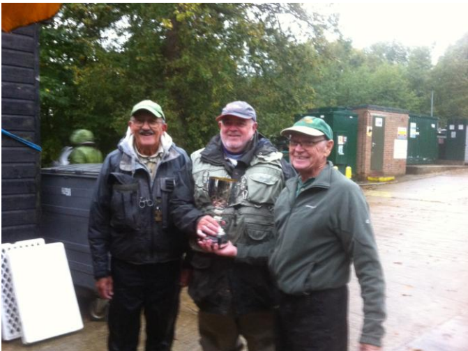
North Kent receiving the trophy

The winners by 3 fish were North Kent once again (boo) we will have them next year. Their chosen charity was Ellenor Lion Hospice. Can I thank all of you who supported the competition this year, it would be nice if we could get a few more members fishing next year.