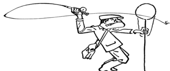
Too much force—