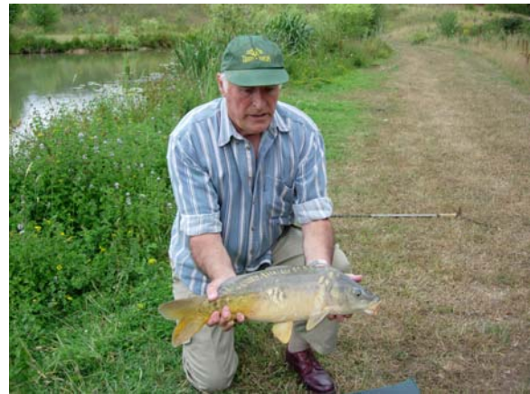
Even the chairman scored!