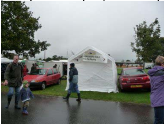
The morning scene!

Sunday was warmer – the only good thing to say! High winds and torrential rain made it impossible to tie in the morning, but come lunch-time the wind dropped sufficiently for us to open up and do a bit of tying. The foul weather did not stop people coming and we had some positive interest during the afternoon. Richard Foster and Steve Mustchin kept the flag flying with wet flies, whilst Roy perversely tied hackled dry flies just to be contrary!