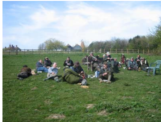
Lunch break at Bewl

My thanks to all those who took part and I hope to see you all again next year.