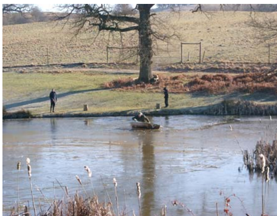
Ice-breaking at Chalybeate

You will recall from the report in the last newsletter that original "Brass Monkeys" outing had to be called off - here's a photograph of why! The Brass Monkeys trophies were awarded at the Hazelcopse event reported on page 2.