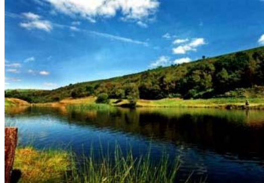
Shimano Felindre big fish water (in the summer!)

foothills. As I parked the car it appeared that I had arrived in a quarry. Now that isn't always unappealing – think of Raygill in Yorkshire, but in this case it doesn't quite work. Maybe I'm being unfair, as most places don't look their best in winter although a good dusting of snow can normally transform a grot-hole into a picturesque wonderland – unfortunately this place still looks like a quarry with snow in it.