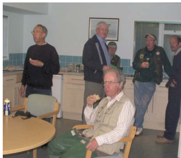
Dry inside – some members in the Lodge after fishing