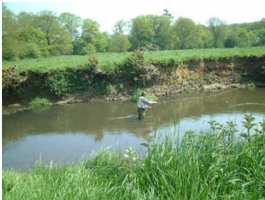
Wading the Torridge