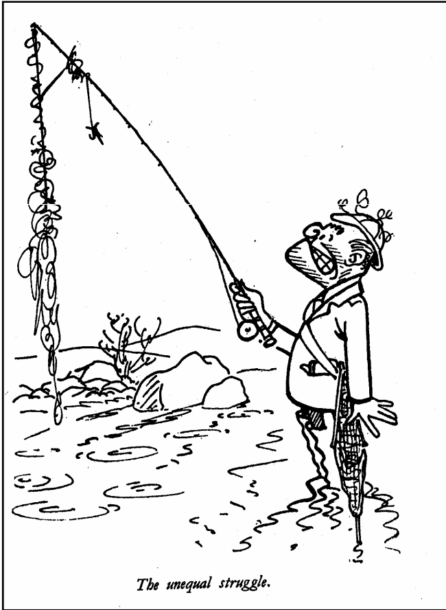
The unequal struggle.